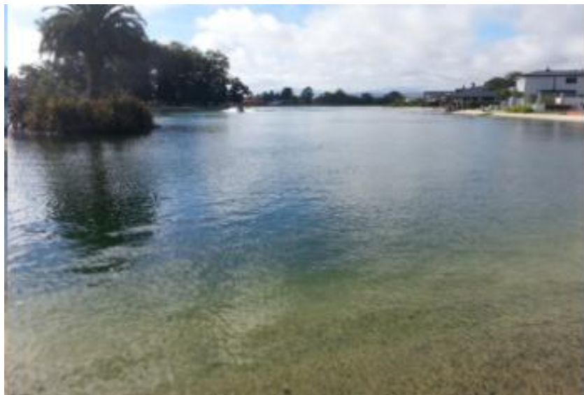
Figure 2: After Treatment

An absolute change in the value of dissolved oxygen and pH value of the water was observed after using the Chlorofluorocarbon treatment.