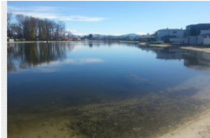
Figure 1: Before Treatment